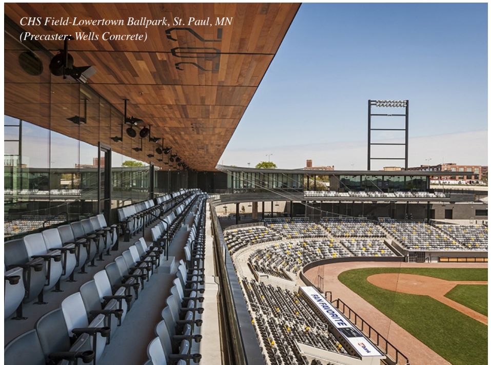
CHS Field-Lowertown Ballpark, St. Paul, MN (Precaster: Wells Concrete)